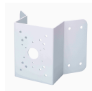
DH-PFA151 Corner mount bracket