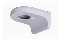
DH-PFB203W Wall mount bracket